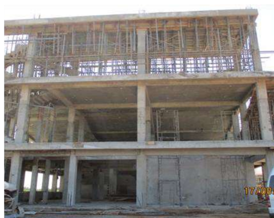
ATI Mannar Estimated Cost Rs.. 529 million

Figures of the Construction Projects implemented under the AHEAD Project