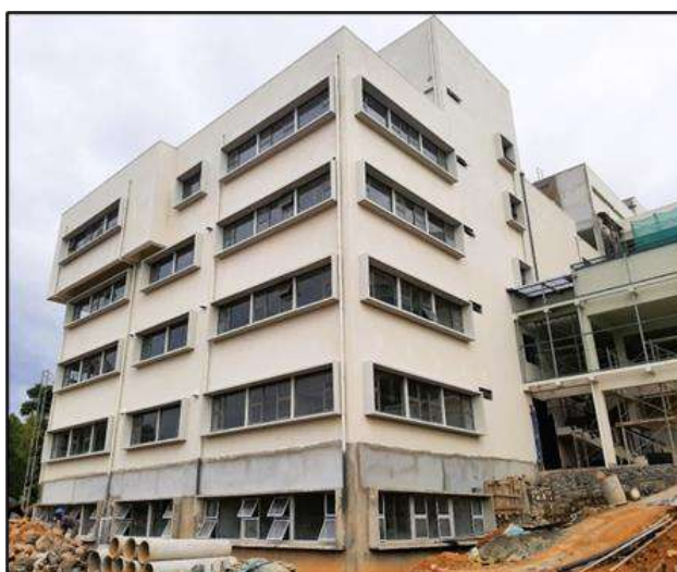
Research Building – Sabaragamuwa University