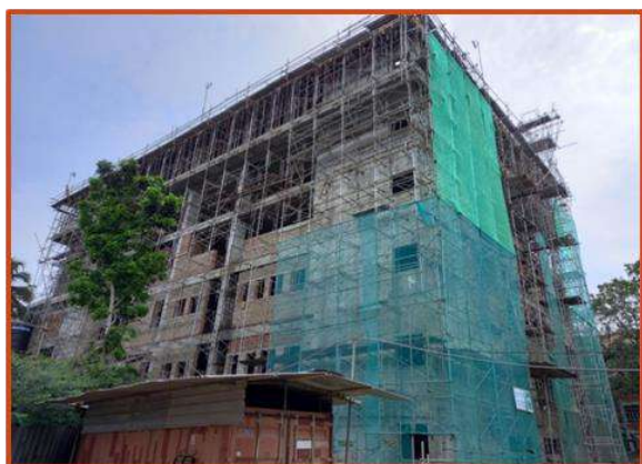
Project of Constructing Twelve Storied Building for the Faculty of Medicine, University of Ruhuna

The total cost of this project, which is being implemented according to a 2019 budget proposal, is Rs. 3,000 million and the area of buildings to be constructed under this project is 117,929.60 square feet. The contract for this project was awarded on 24.11.2020. Rs. 134.69 million has been released as advance in the year 2020. Rs. 350 million has been allocated for the year 2022 and out of that amount, Rs. 415.9 million has been disbursed as at 31.12.2022 and the cumulative expenditure incurred as at 31.12.2022 was Rs. 1101.7million. The physical progress of the project is at the level of 58% by 31.12.2021.