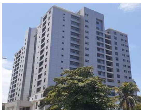
Project of Constructing Pre-Clinical Building of the University Colombo

This is the largest project in the higher education sector to be implemented under local loans. So far, the construction work has been completed here and the work of fixing the defects is still going on. The consulting company has issued the relevant certificate (Taking over Certificate) as the date of taking over the project on 2022.06.08. The contractor has also handed over the final bill to the consultancy firm. So far, Rs.5,645,767,257.24 has been paid as Rs.5,346,658,175.00 (with VAT) to the contractor, Rs.198,124,312.91 to the consulting company and Rs.100,984,769.33 as other payments made for the project.