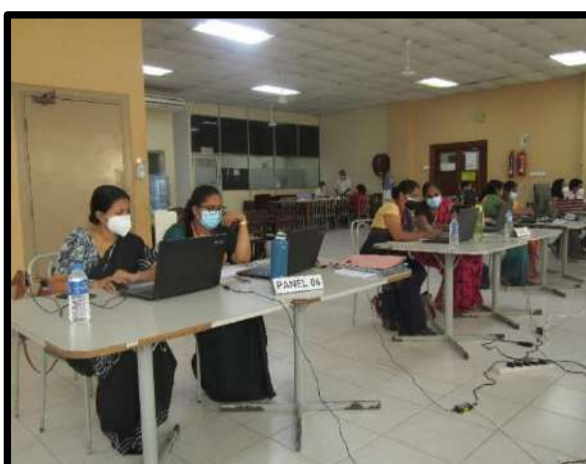
Conducting online interviews for the selection of 6 th intake.