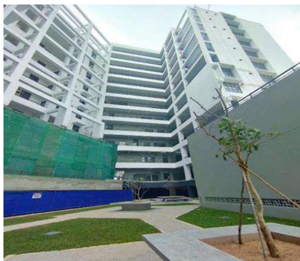
Laboratory Building- Faculty of Technology, University of Kelaniya