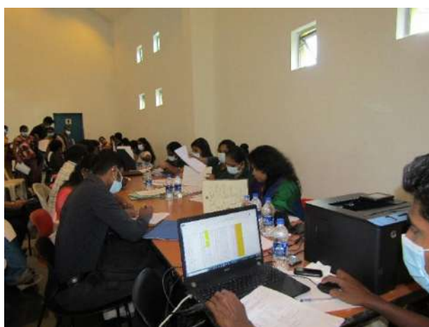
Conducting registration for the 6 th intake at Non-State Higher Education Institutes