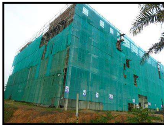
Project of Constructing Allied Health Sciences of the University of Ruhuna