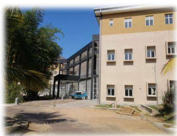
Three Storied Lecture Hall Building for the Faculty of Technology, University of Ruhuna Estimated Cost Rs. 412 million