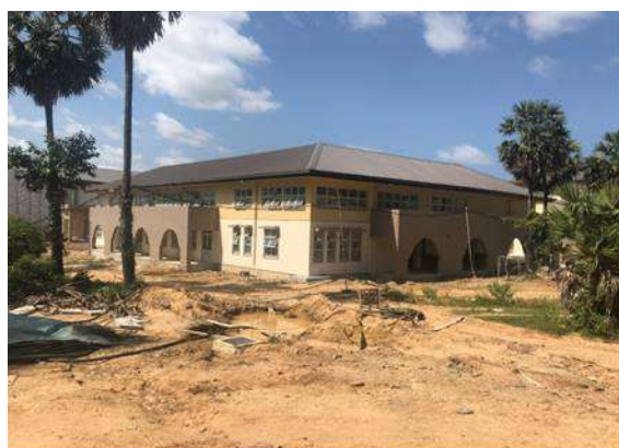
Library and Self-learning facilities

Construction activities have been completed by the end of 2022 and few images of the buildings are given below.