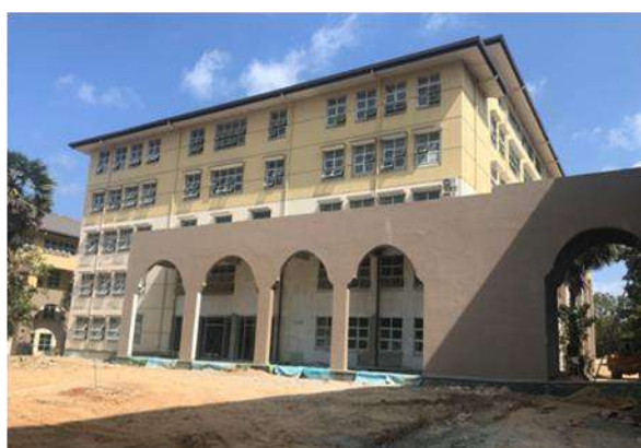
Department of Clinical Sciences and Department of Supplementary Health